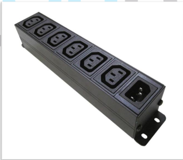
IECKIT - IEC Power Strip + cables