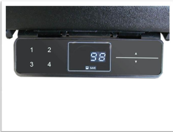
Retractable Control Module