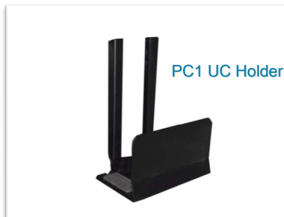
PC1 UC Holder