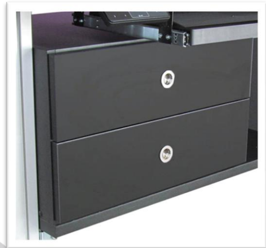
DR2 Dedicated Drawers