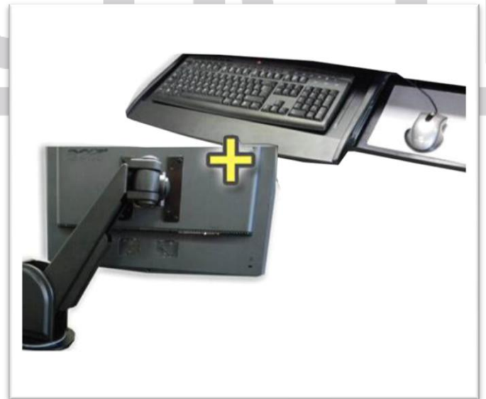
ARM1 Information Package